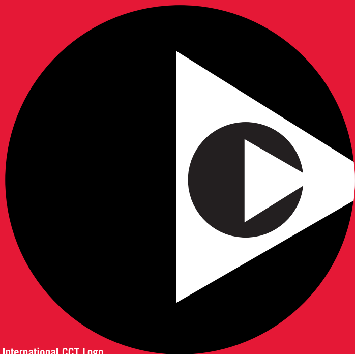
* International CCT Logo

Copy Control Technology has been introduced to Australia on some CDs. In this guide, we answer the most frequently asked questions about this technology.